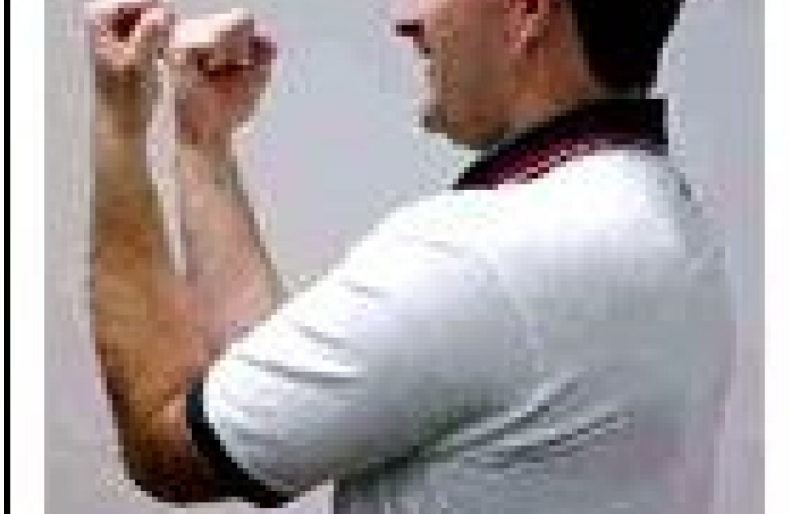
DIAGNOSIS & DIAGNOSTIC EQUIP