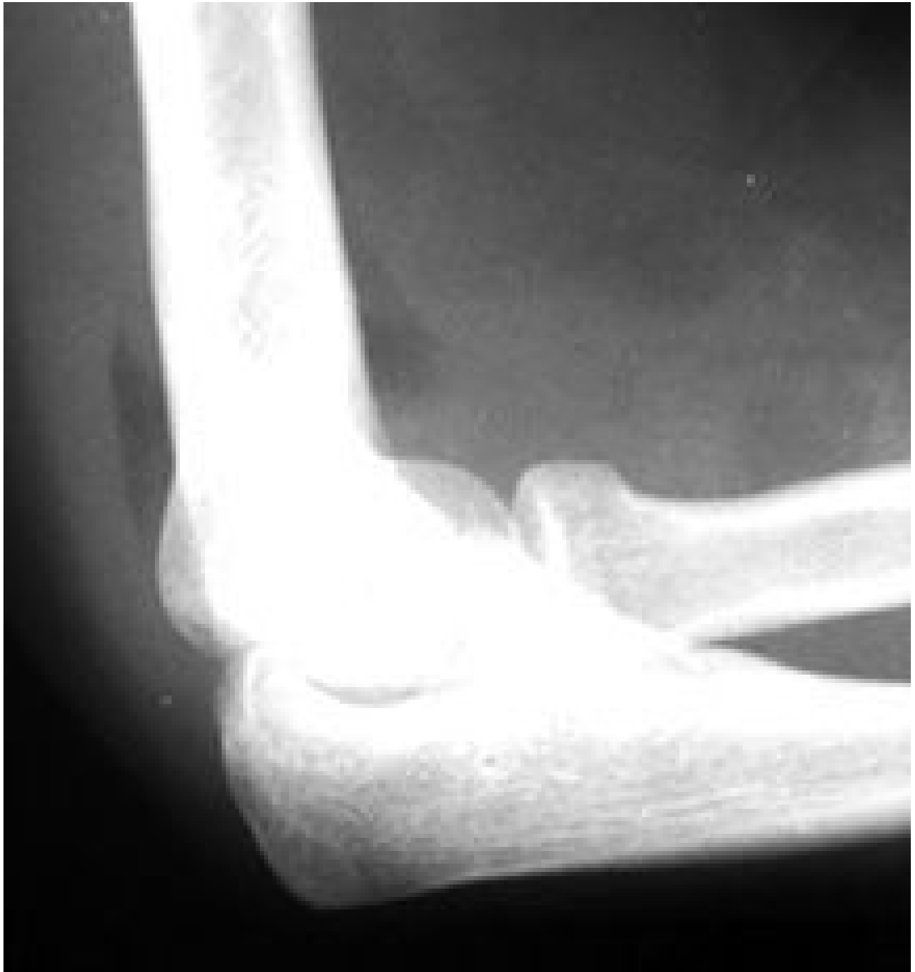
X-ray demonstrating positive fat pad sign.

Once X-rays are taken, it's a matter of reviewing the films methodically. Four questions should be kept in mind when reviewing pediatric trauma cases (when in doubt, have the films reviewed by a radiologist):