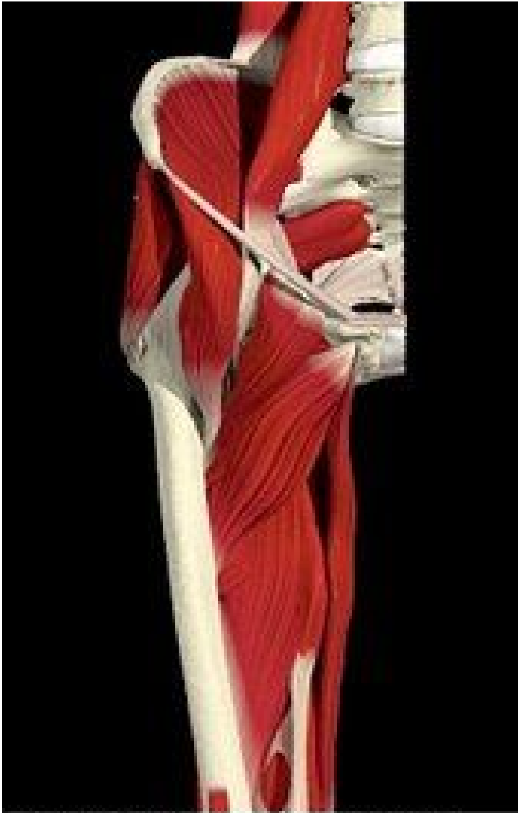
Muscles of the anterior hip, including iliopectineus, pectineus, adductor and gracilis origins.