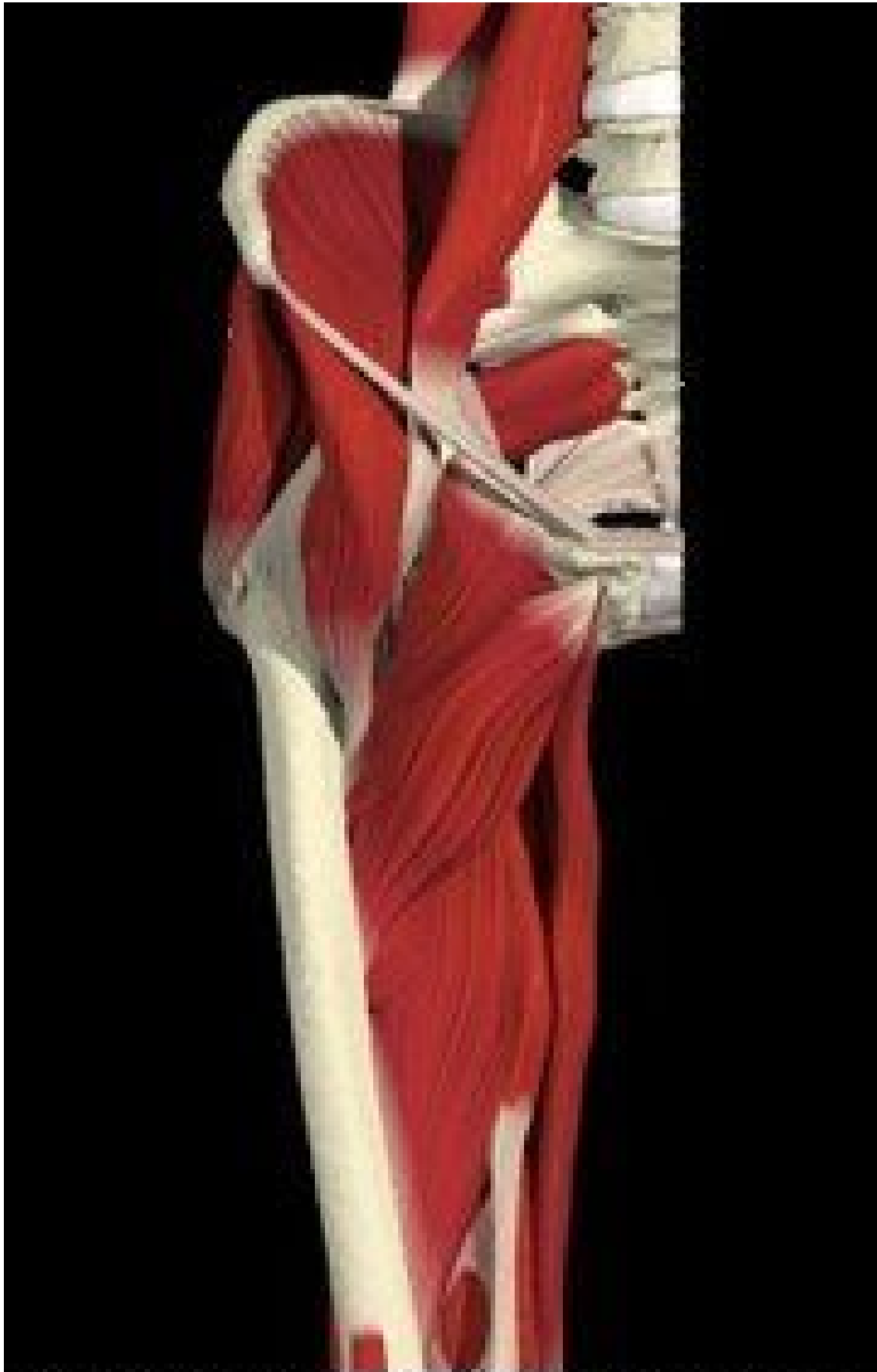
The hip with adductors and psoas.