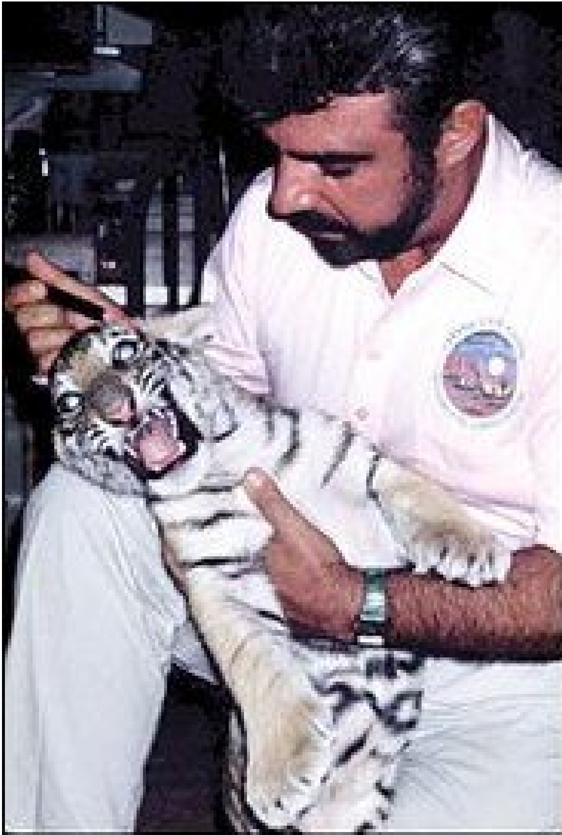
Treating a Siberian tiger with a laser for spasmodic torticollis.