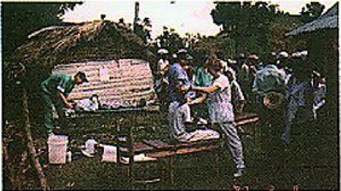
Palmer faculty clinicians and student externs at work on a mountainside near Trouin, Haiti.

The average citizen of Haiti has limited access to medical care, and virtually no familiarity with