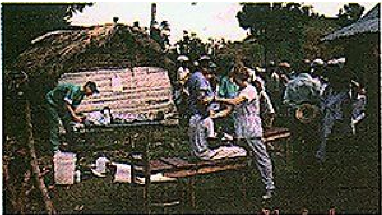
Palmer faculty clinicians and student externs at work on a mountainside near Trouin, Haiti.

The average citizen of Haiti has limited access to medical care, and virtually no familiarity with