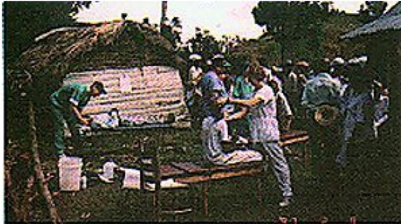
Palmer faculty clinicians and student externs at work on a mountainside near Trouin, Haiti.