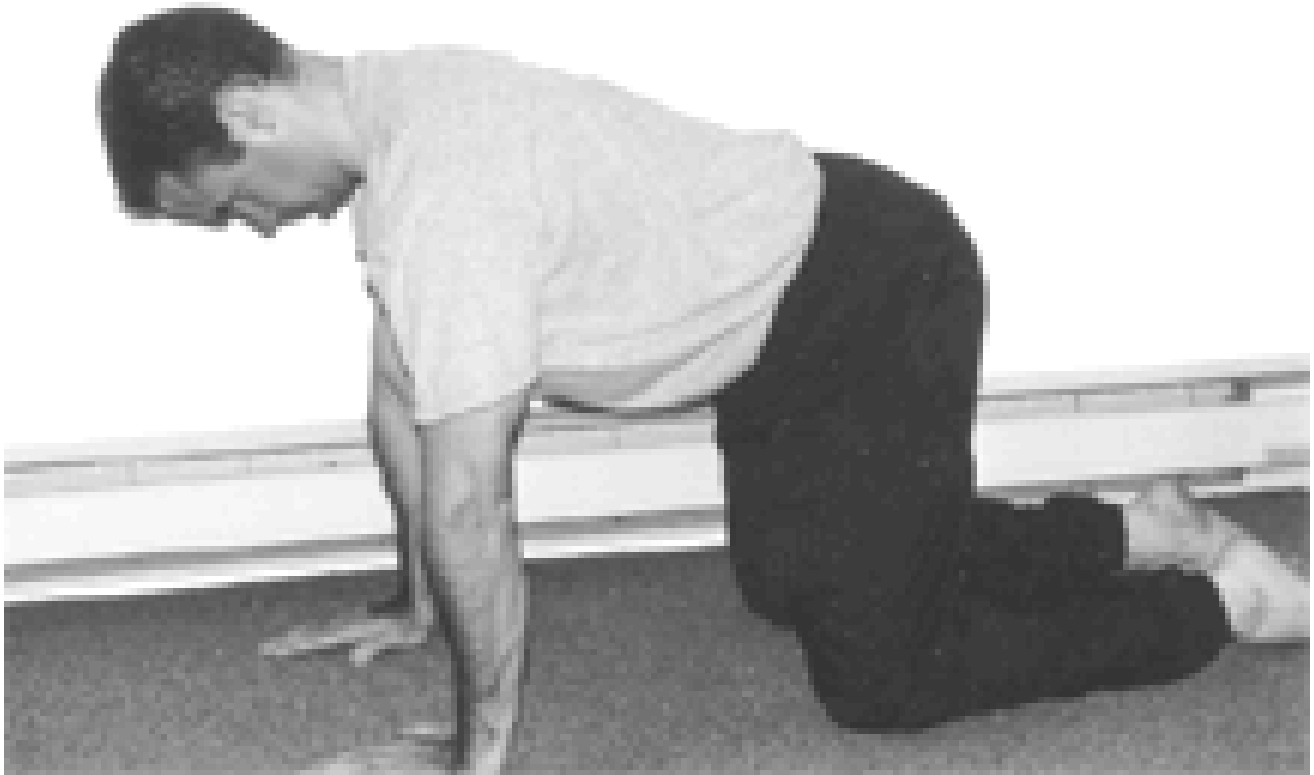
Figure 2: Cervical brace in the quadruped position. Reprinted with permission from Murphy DR (ed.) Conservative Management of Cervical Spine Syndromes . New York: McGraw-Hill, 1999.

Floor exercises can be used to enhance cervical and scapular stability. The basic starting point is training the patient to perform a cervical brace (see Figure 2). The patient co-contracts the deep cervical flexors and lower cervical/upper thoracic extensors. Mastery of this co-contraction maneuver is essential for the success of the training. Patients are then instructed in a series of limb movements that they carry out while maintaining the cervical brace position (see Figure 3).