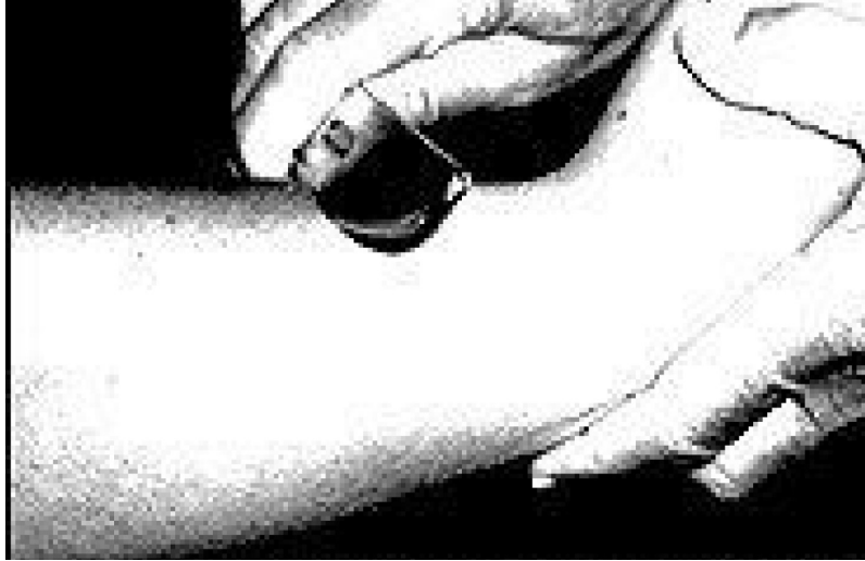
SOFT TISSUE / TRIGGER POINTS