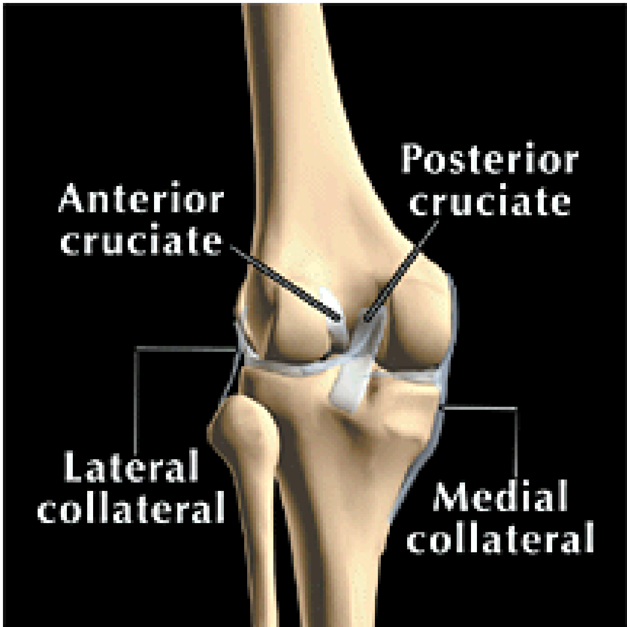
Figure A: Ligaments of the knee

The femoral notch is the space at the bottom of the femur through which the ACL runs. When doing comparative studies, it was found that this notch was narrower in females than males. Some feel that the tighter fit may cause a shearing effect on the ACL by the femur. (See Figure A.)