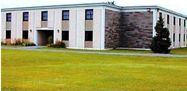
NYCC's Seneca Dormitory will be renovated to become the Seneca Chiropractic Health Center.