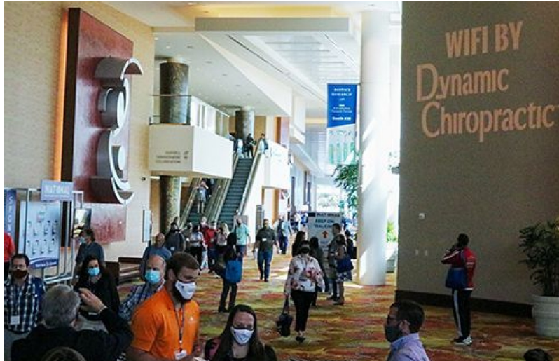
SEMINARS / CONVENTIONS