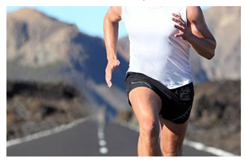
ORTHOTICS & ORTHOPEADICS