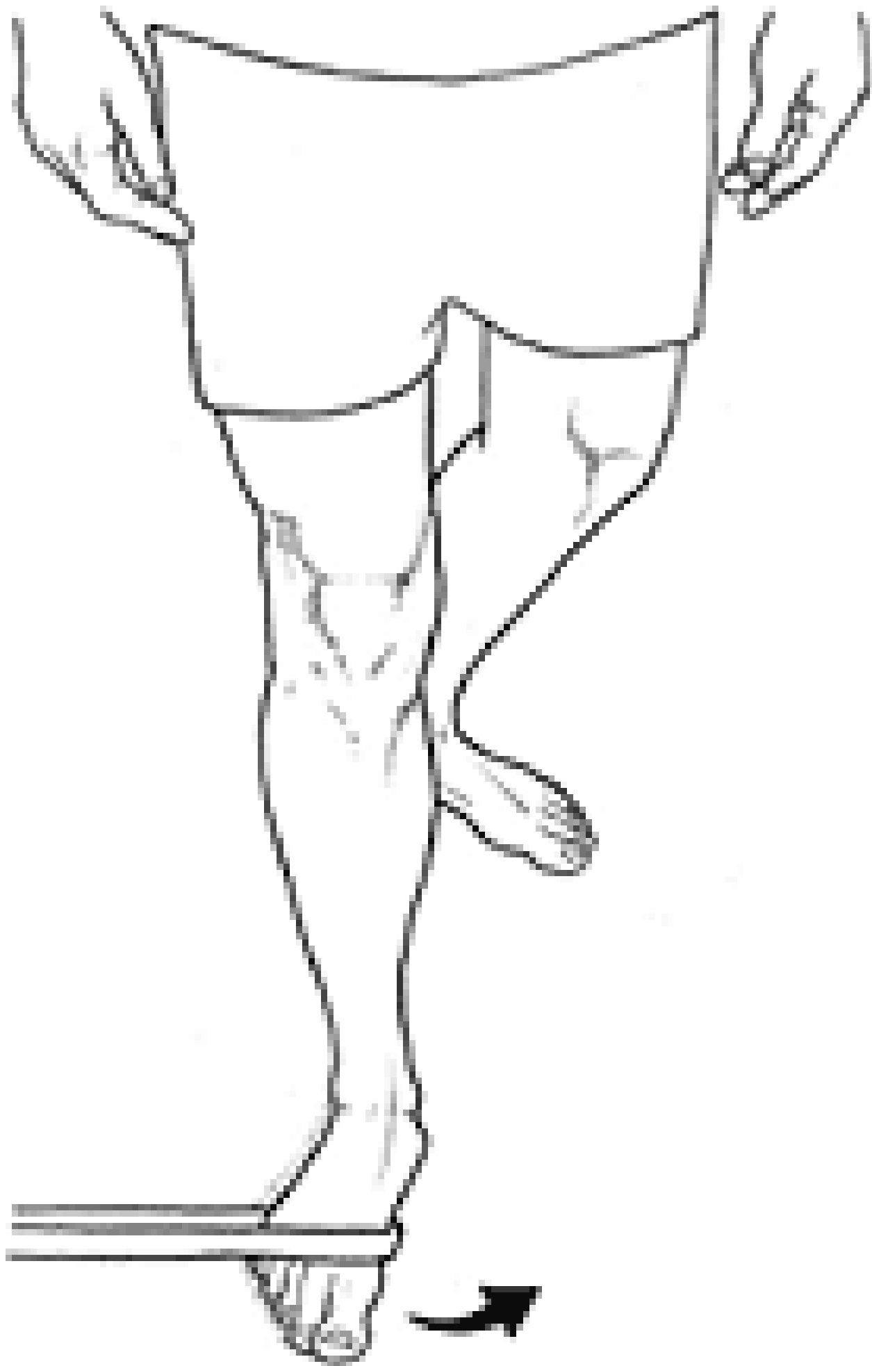
Fig. 3. Popliteus exercise. The knee is maintained in a fixed and slightly flexed position while the forefoot is