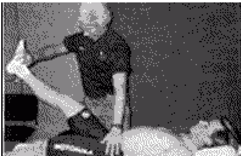
EDUCATION & SEMINARS