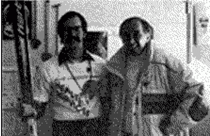
SPORTS / EXERCISE / FITNESS