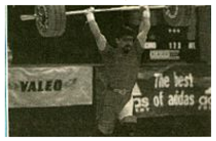
NEWS / PROFESSION