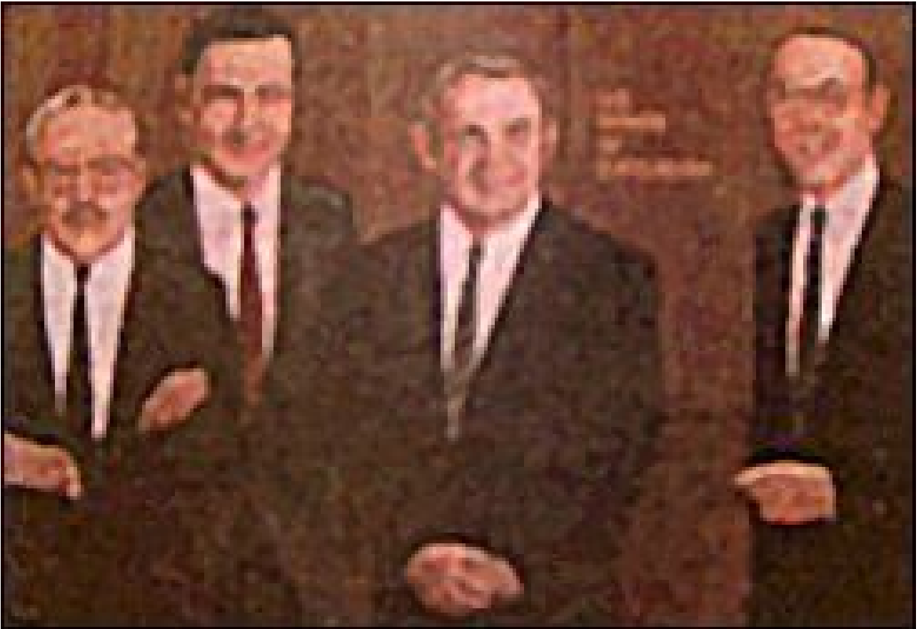
"Educational Accreditation" by Jack Smith, Cape Coral, Florida (28" x 22")