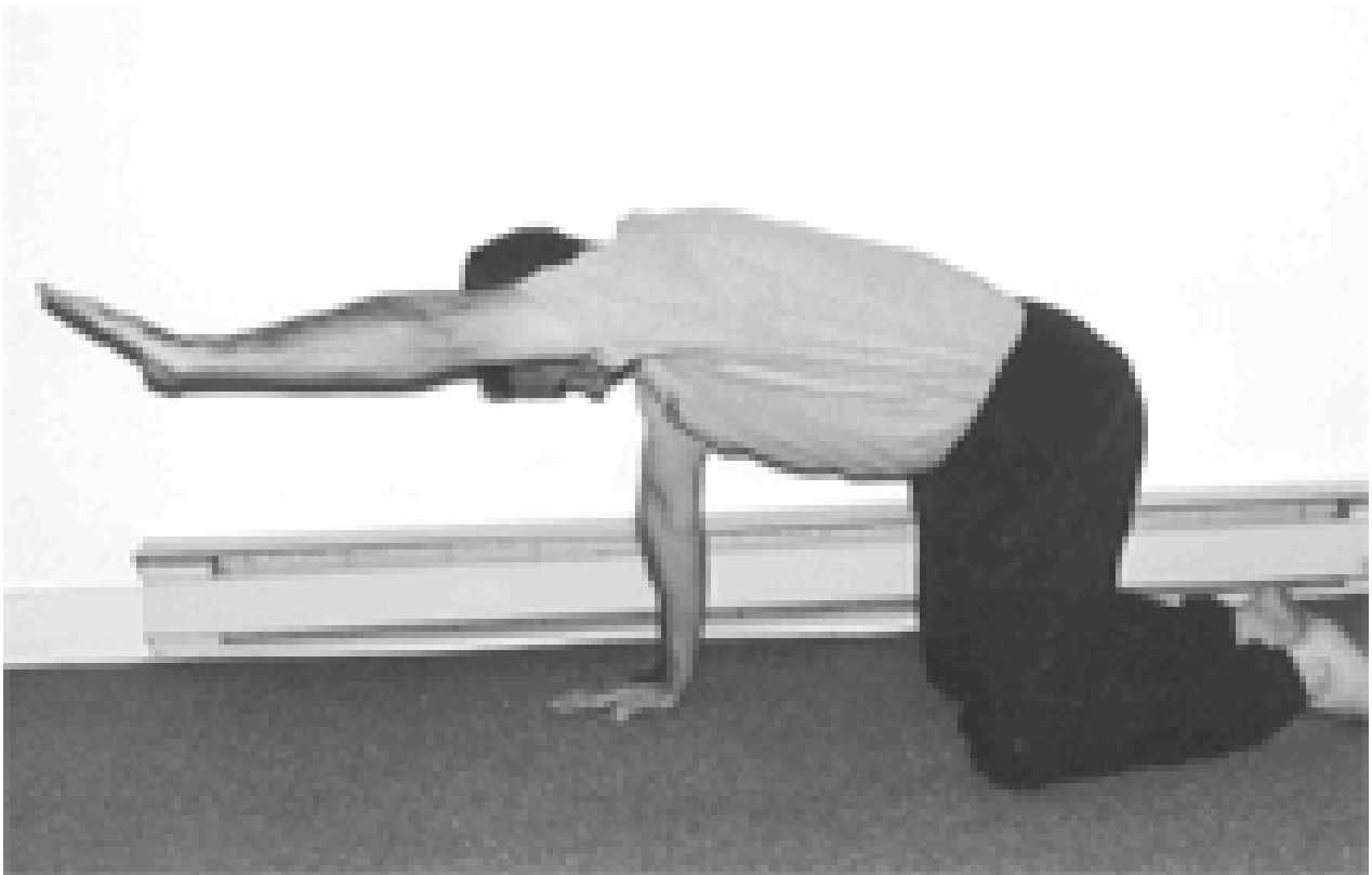
Figure 3: Arm movements while holding the cervical brace. Reprinted with permission from