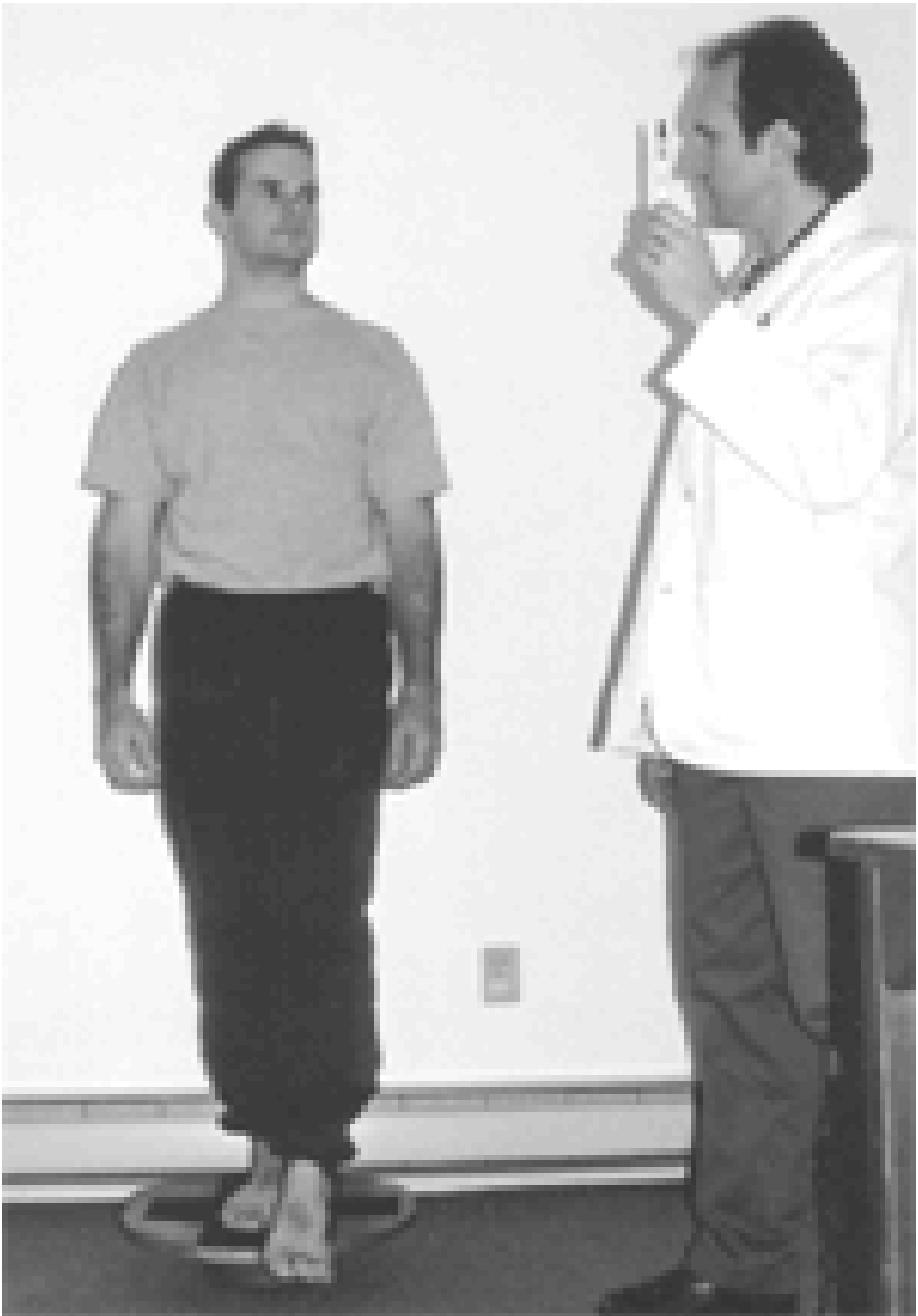
Figure 4: Facilitation of oculomotor reflexes while balancing on a wobble board. Reprinted with permission from Murphy DR (ed.) Conservative Management of Cervical Spine Syndromes . New